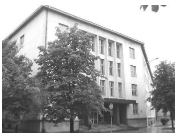
A. Goštauto g. 9, Vilnius (1962-2016)