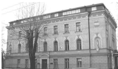
Kosčiuškos a. 30, Vilnius (1947-1962)

Dedicated to 75 th anniversary of the foundation of Institute of Chemistry and Chemical Technology (Est. 1945)